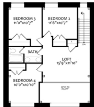
SECOND FLOOR PLAN 975 sq.ft. (115 sq.ft. O.T.B.)